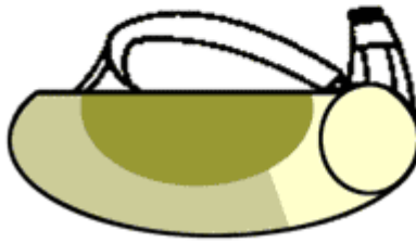
Internal-frame pack (Rough terrain)